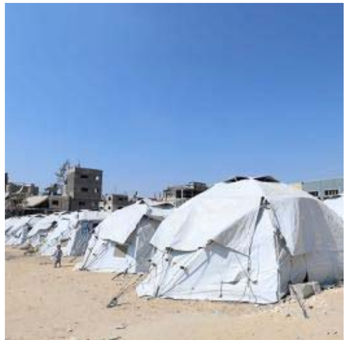
ShelterBoxes are issued to millions of those whose homes have been lost.