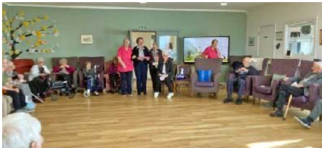
World Day of Prayer at Bradbury Centre, Bonar Bridge