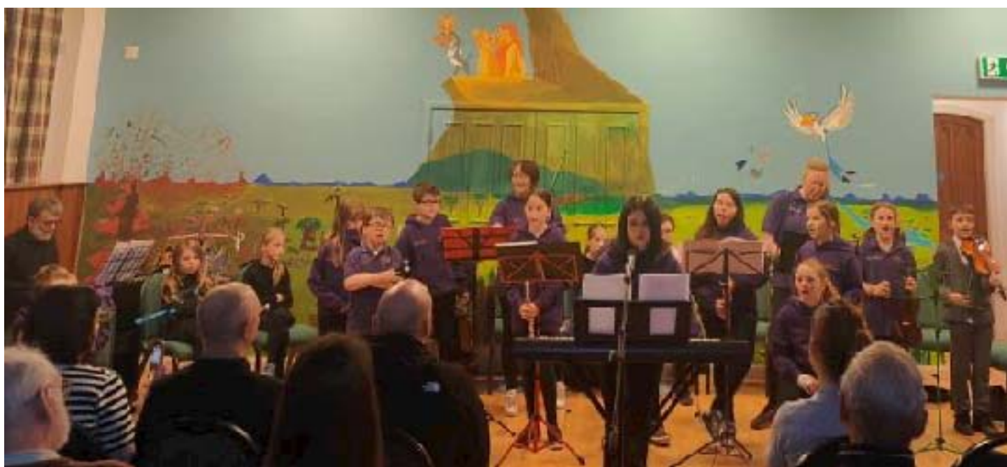
Dornoch Firth Youth Band singing Red Ian's Lament – their first Gaelic song.