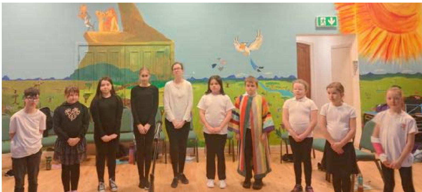
Youth Theatre Group beginning their "Musicals Journey"