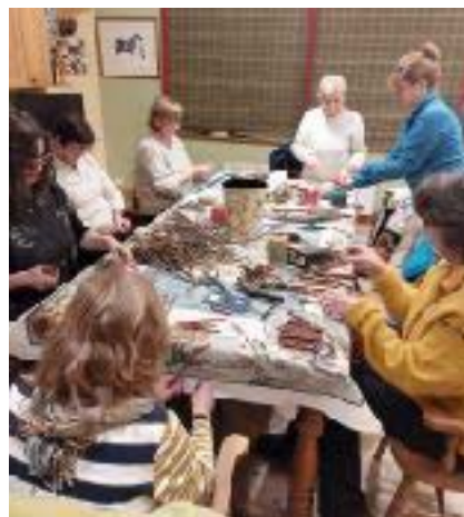
What is your Easter gift going to be?