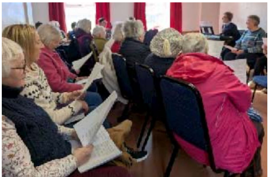
Guild meeting in Bonar Bridge Village Hall