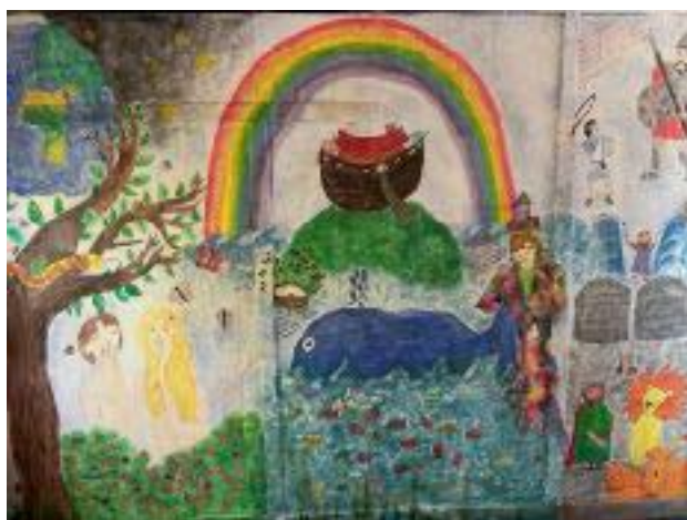
Mural painted by Creich Sunday School

In the past we have run Sunday School in church, Scripture Union in the school and held holiday clubs in the summer. We will look again at engaging with our young people and using a variety of fun gatherings.”