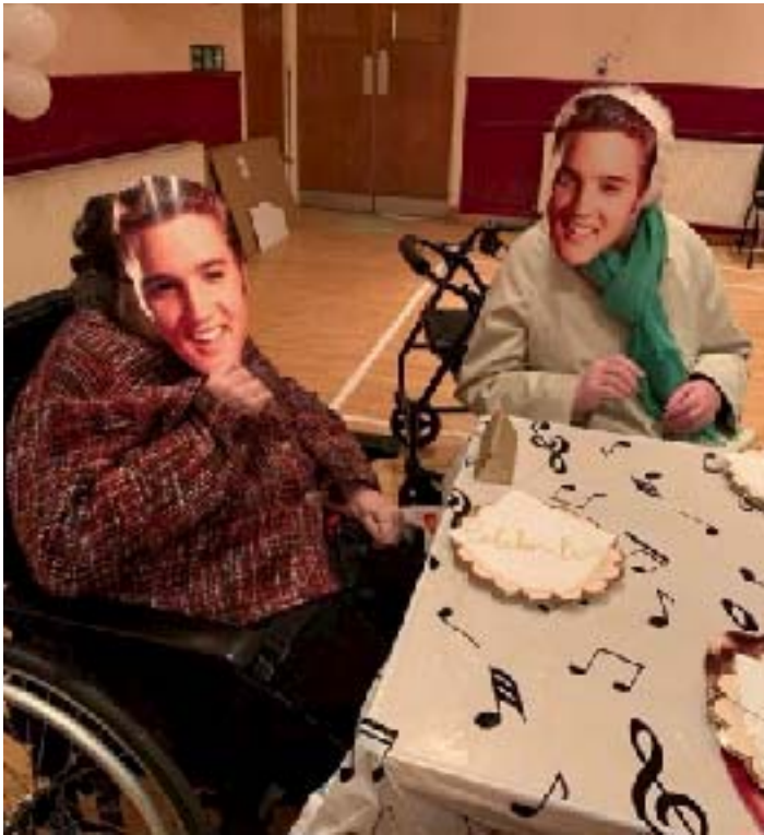
They weren't Lonesome Tonight or in the Heartbreak Hotel