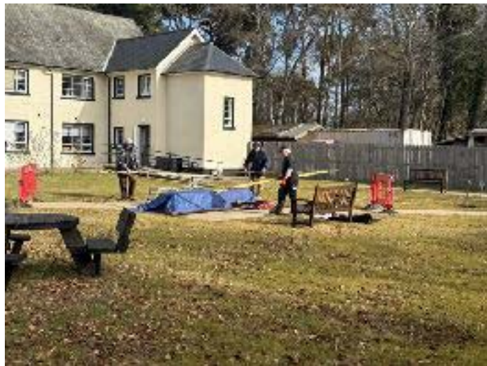
The Mens Shed at work on the Sensory Garden