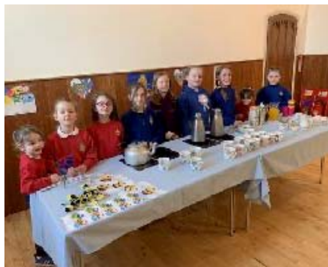
All ready to serve at the Coffee Morning