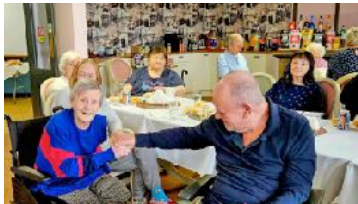
Oversteps Topsy Tea Party