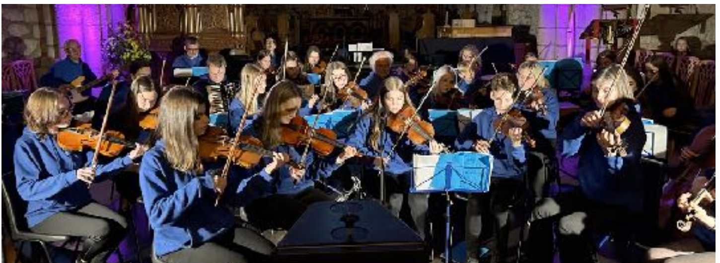
Gizzen Briggs perform

THE DORNOCH FIRTH Junior Band was delighted to be asked to perform at the recent Gizzen Briggs fund-raising concert. Inspired by this invitation, the children have worked really hard since the summer holidays.