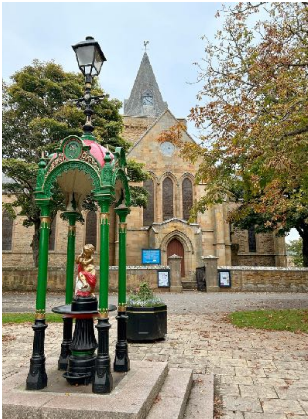
The view from Cathedral Green as Autumn begins