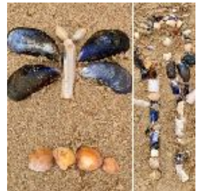
Monday Group Beach Art