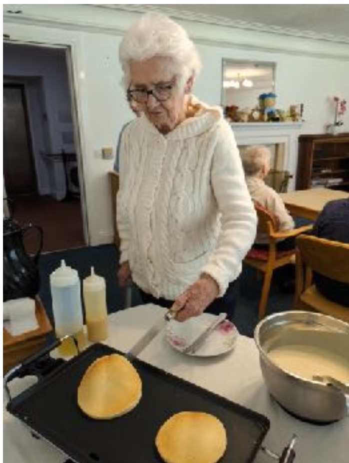
Baking at Oversteps