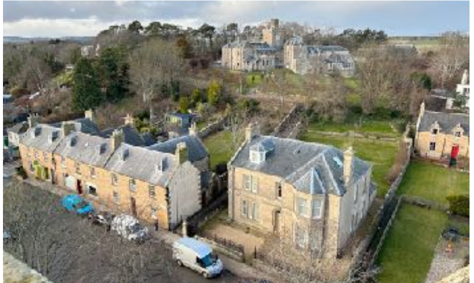
View from the tower parapet towards High St and UHI Campus