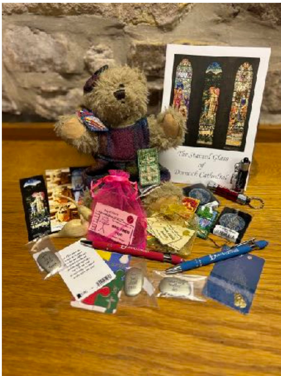
Welcome Table – a selection of gifts