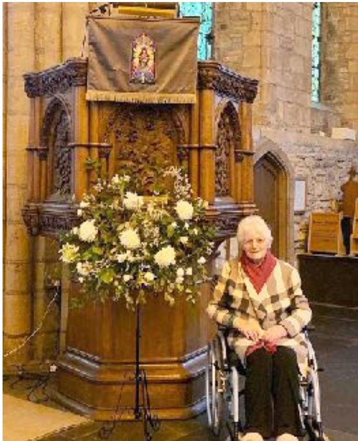
A visit to the Cathedral