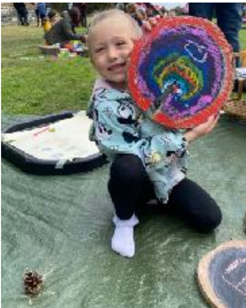
Wednesday Group Fun Day

‘Tuesday Tots’ runs between 10-11.30am and we are delighted that so many new families are joining us for our themed sensory play days. Our aim is to provide families with a range of activities which stimulate the senses, provoke curiosity and support the developing skills of the babies and toddlers who attend. It really is a great morning out! It costs £1.50 per family to attend. Contact is <jen@dfgcommunity.com>