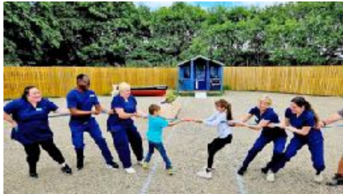
The Oversteps Highland Games