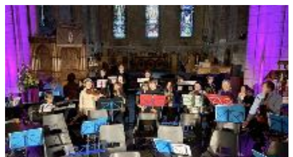
The Dornoch Firth Junior Band