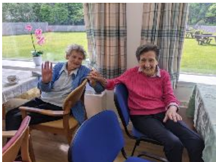
Golspie Hub visitors