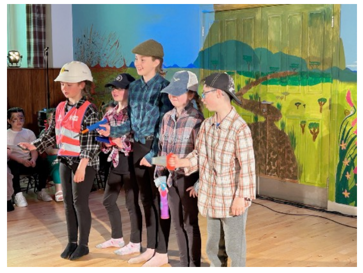
The lumberjacks were the 'baddies' tearing down the trees