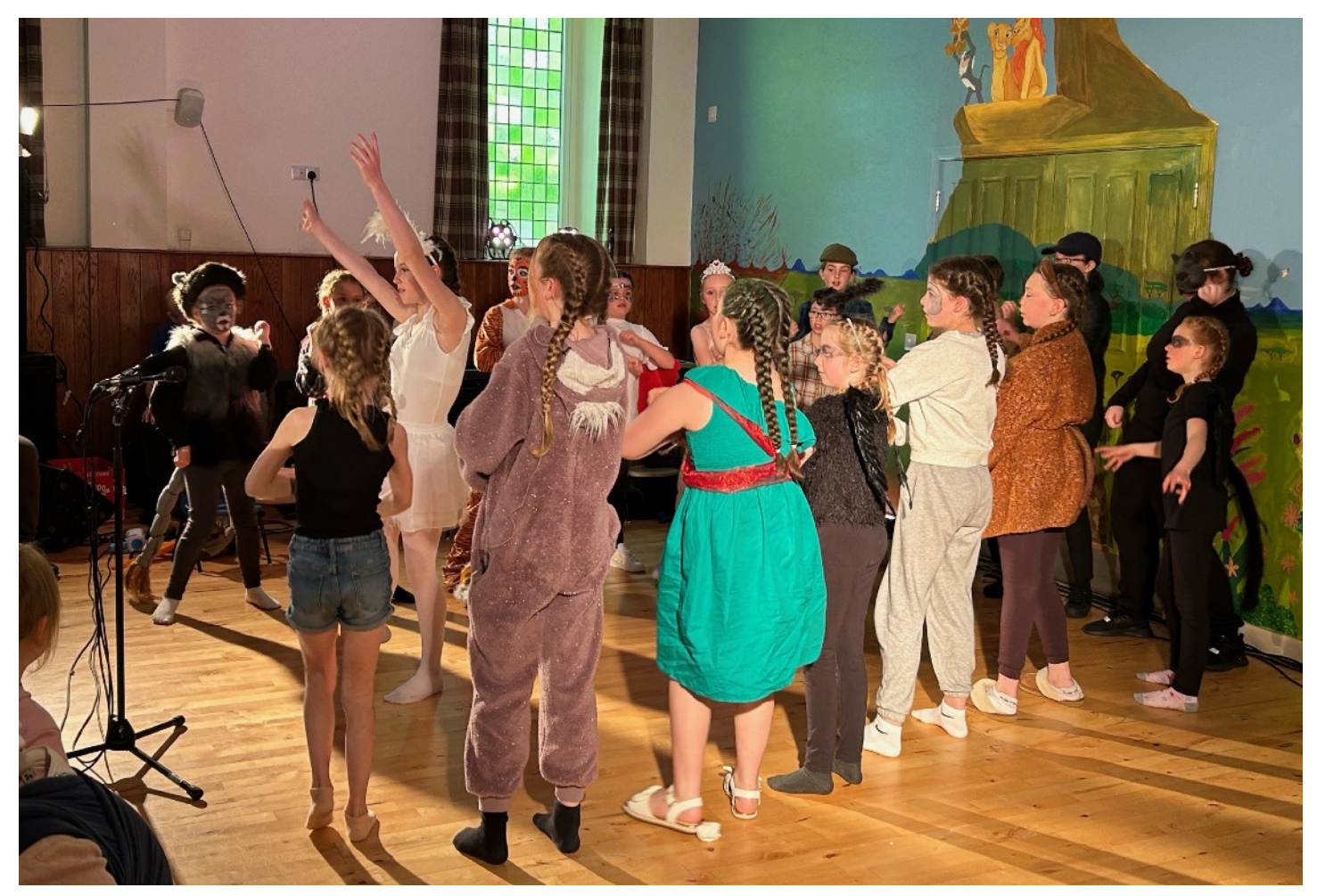
Even Abba's Dancing Queen was in Jungle Book