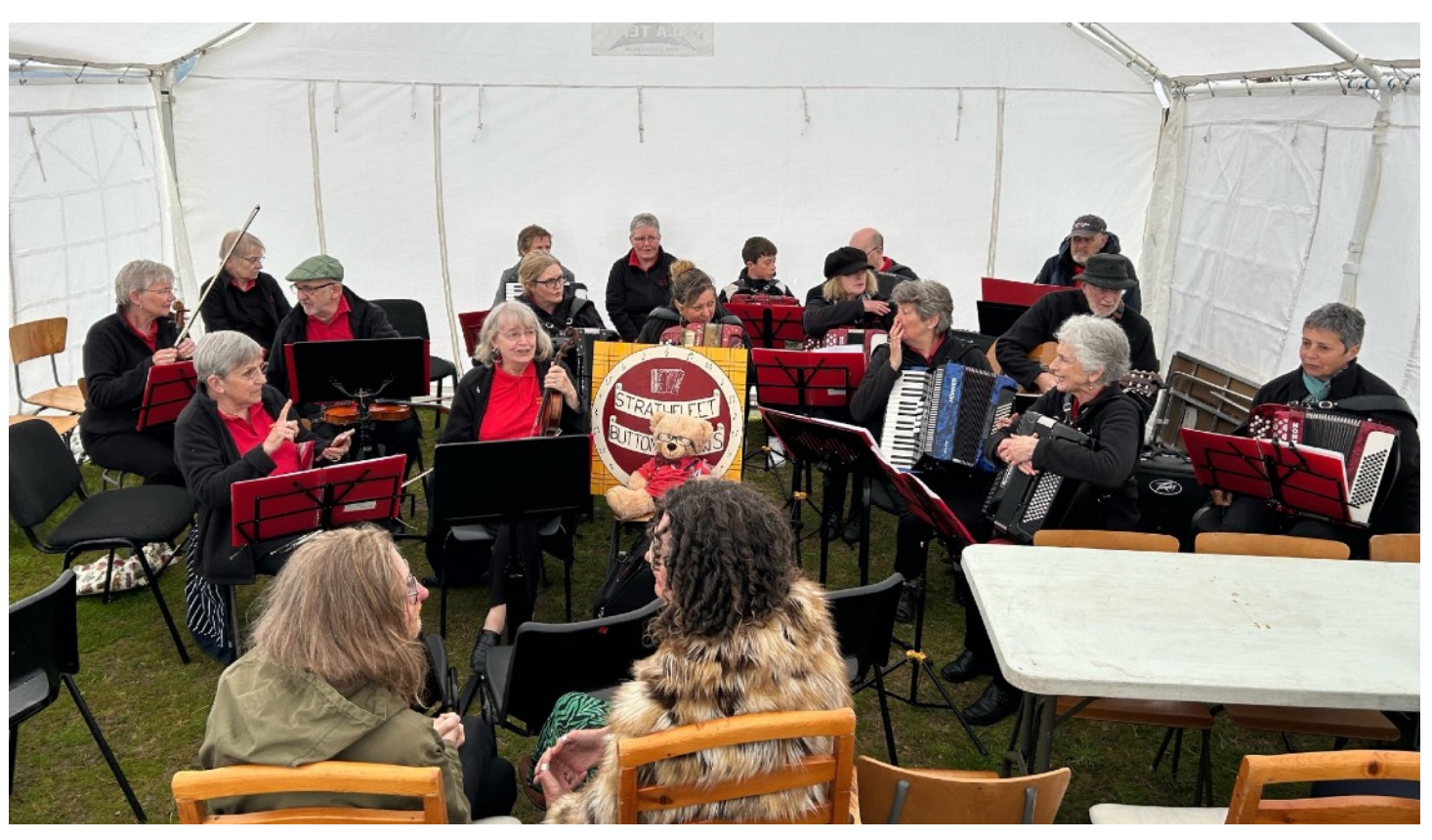
Strathfleet Buttons & Bows - (even the Band were clapping to warm their hands)