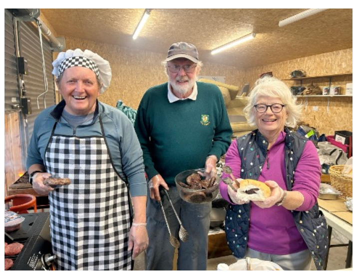
BBQ Masterchef at Meikle Caption Master Chef at Meikle