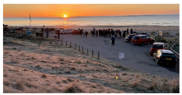
Sunrise service at the beach