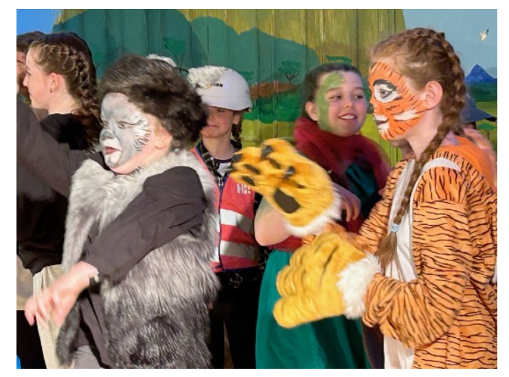
Make-up and costumes were very professional

This is another performance that the children will remember and the parents and grandparents enjoyed, appreciating the many hours the Youth Theatre adults have devoted to the production since March