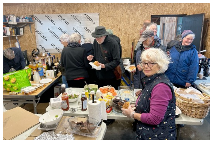
Service at the Porter Bistro