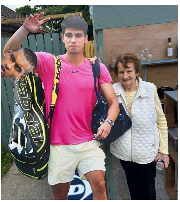
Meadows Wimbledon Fun Day