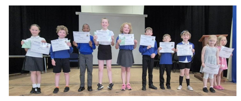
St Gilbert Awards for Primary 1, 2 & 3 pupils

The St Gilbert Awards for pupils of Dornoch Primary School are sponsored by Dornoch Cathedral. The winners are chosen by votes from their fellow classmates. The awards are given for showing kindness to others. Presentations took place at the end of term Assembly and Prize Giving.