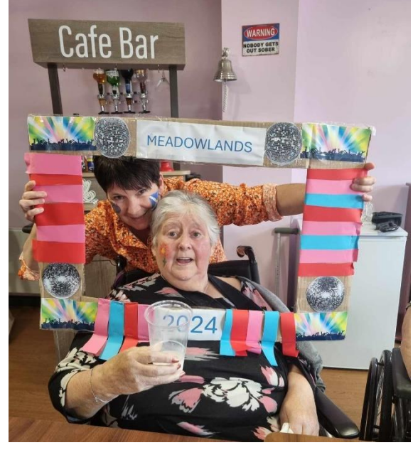
Meadowlands Music Festival

The residents have had a busy time with various activities. They entered the spirit of Wimbledon with a Tennis Fun Day, and as well as attending the Primary School Sports Day, pupils in the Higher PE class helped the staff to hold a Residents Sports Day. They had a Meadowlands Music Festival and also a cake stall at the Academy School Fayre.