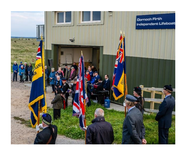
Both the Dornoch Pipe Band and members of the British Legion paraded.