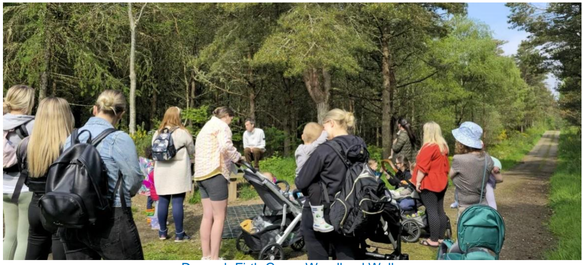
Dornoch Firth Group Woodland Walks

Visit our Facebook page DornochAreaFamilyEvents