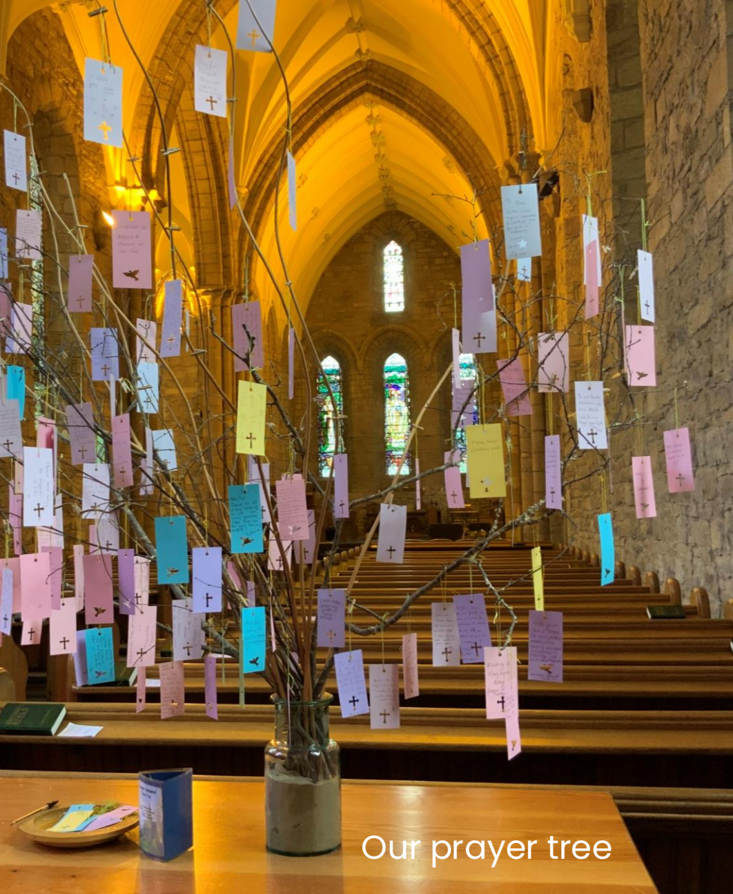
Our prayer tree